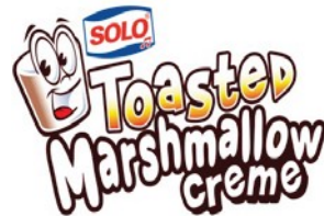
Solo Toasted Marshmallow Creme