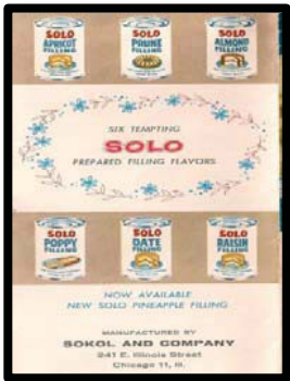
Solo Brand retail items expand