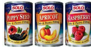
Industry leader in processing and packaging custom food products & own retail brands