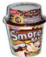
Solo S'mores Stuff