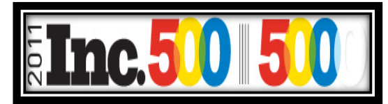
Sokol and Company named to INC. 5000 for 2 nd time