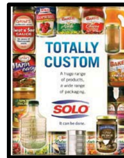
Emphasis on custom manufacturing, anchovy products; Solo Frozen Kolacky introduced; R&D/Q&A expanded.