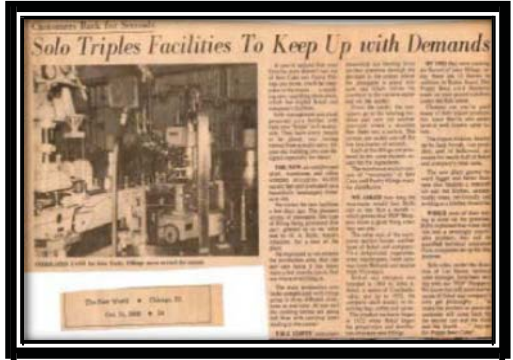
Sokol and Company builds new 35,000 sq. ft. facility in Countryside, IL.