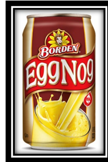
Sokol launches Borden® EggNog Single Serve