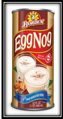
Sokol acquires Borden® EggNog