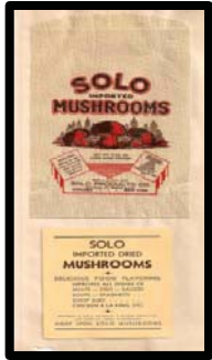
Re-emphasis on international spice activities and dehydrated foods