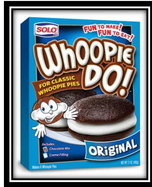
Sokol launches Solo® Whoopie Do! Line of whoopie pie baking mixes